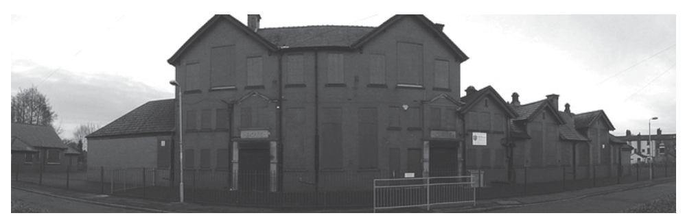
The old school on Avondale Drive

A collection of remarks from the School's Log Book of 1908 – 10