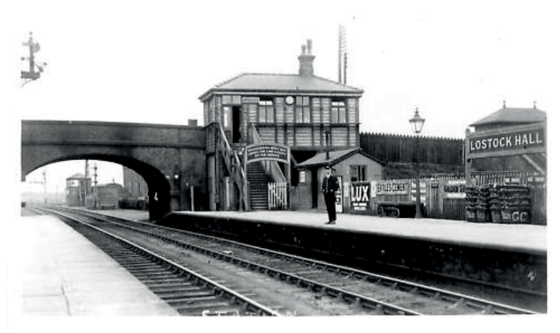
Lostock Hall Station